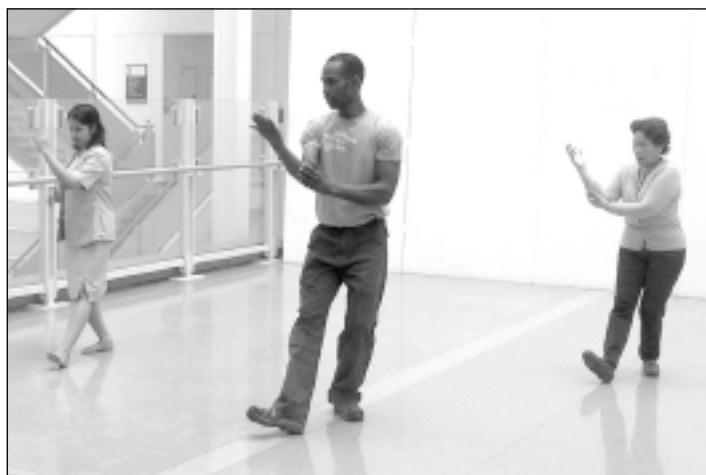
■ Kensington and Chelsea College Tai Chi taster session

Prizes for the learning awards, quizzes and raffles were kindly donated by Camille Hair Design, Lush, Ordning & Reda, Tray Gourmet, CE Harrod Pharmacy, Me and My Baby Therapy Rooms and Clinic, Culpepper and Pizza Express.