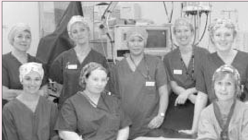
■ Members of the Paediatric Theatres team at Chelsea and Westminster.