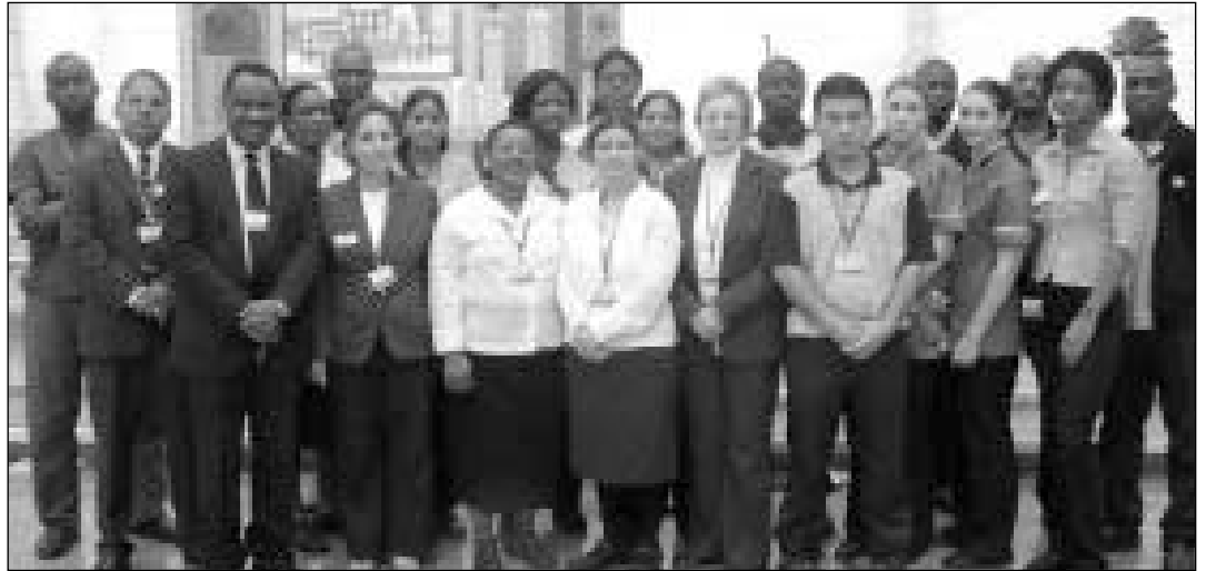
■ Pictured are some of the staff who helped services run smoothly.

"Our estates department located the source of the problem quickly. A lot of work was then done to clean the areas - as well as carrying out the necessary health and